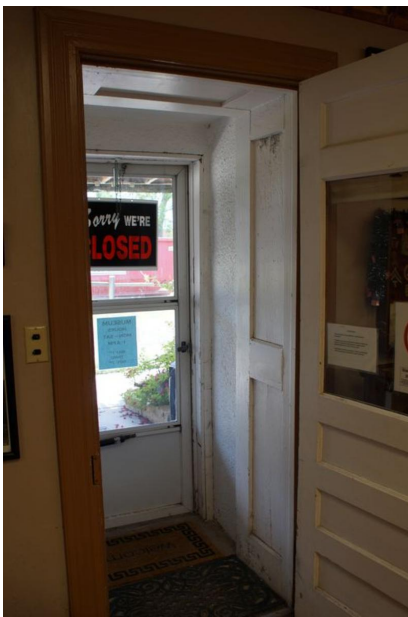
Fort Dodge – Army Quartermaster Building. 217 Pershing Street. Interior, primary entrance; looking east. 05/25/2017.