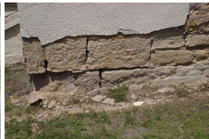
Fort Dodge – Army Quartermaster Building. 217 Pershing Street. East elevation at southeast corner of building; looking west. 05/25/2017.