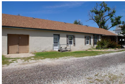
Fort Dodge – Army Quartermaster Building. 217 Pershing Street. North end of east elevation; looking northwest. 05/25/2017.