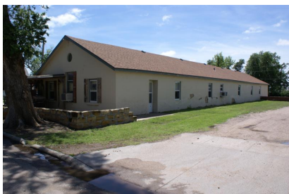
Fort Dodge - Army Quartermaster Building. 217 Pershing Street. North and west elevations; looking southeast. 05/14/2015.