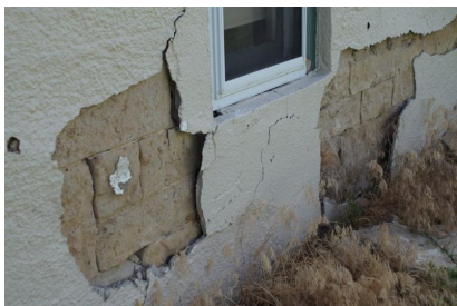
Fort Dodge - Army Quartermaster Building. 217 Pershing Street. West elevation; looking southeast. 05/25/2017.