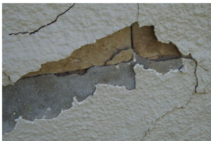
Fort Dodge - Army Quartermaster Building. 217 Pershing Street. West elevation; looking east. 05/25/2017.