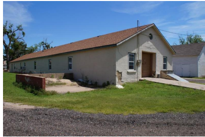
Fort Dodge – Army Quartermaster Building. 217 Pershing Street. West and south elevations; looking northeast. 05/25/2017.