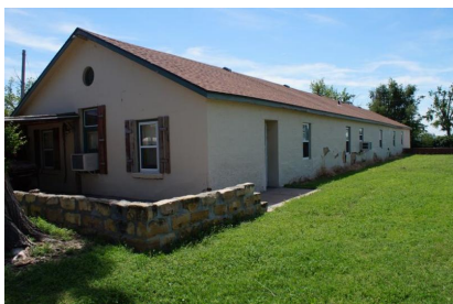
Fort Dodge - Army Quartermaster Building. 217 Pershing Street. North and west elevations; looking southeast. 05/25/2017.