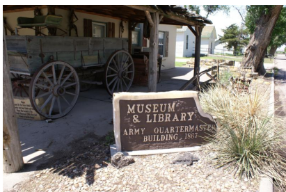
Fort Dodge - Army Quartermaster Building. 217 Pershing Street. North elevation signage; looking west. 05/14/2015.