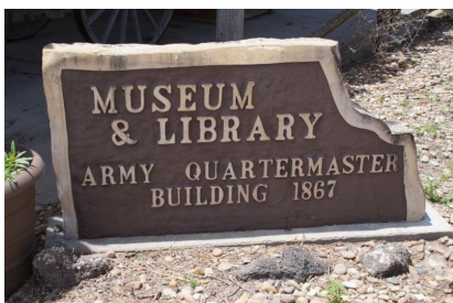
Fort Dodge - Army Quartermaster Building. 217 Pershing Street. Signage at northeast corner of building; looking southwest. 05/25/2017.