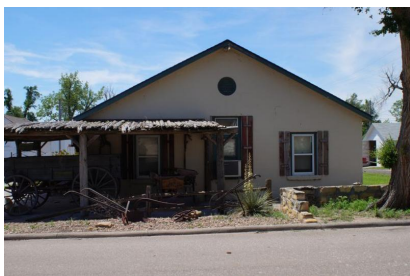
Fort Dodge - Army Quartermaster Building. 217 Pershing Street. North elevation; looking south. 05/25/2017.