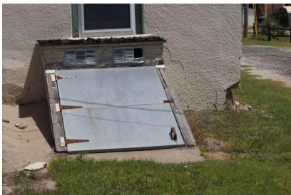
Fort Dodge – Army Quartermaster Building. 217 Pershing Street. South elevation, exterior access to basement; looking north. 05/25/2017.