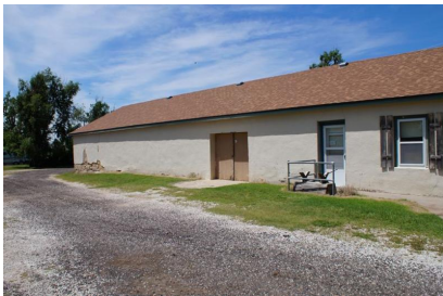
Fort Dodge – Army Quartermaster Building. 217 Pershing Street. South end of east elevation; looking southwest. 05/25/2017.