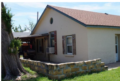
Fort Dodge - Army Quartermaster Building. 217 Pershing Street. North elevation; looking southeast. 05/25/2017. KSHS/Anderson, Rick.