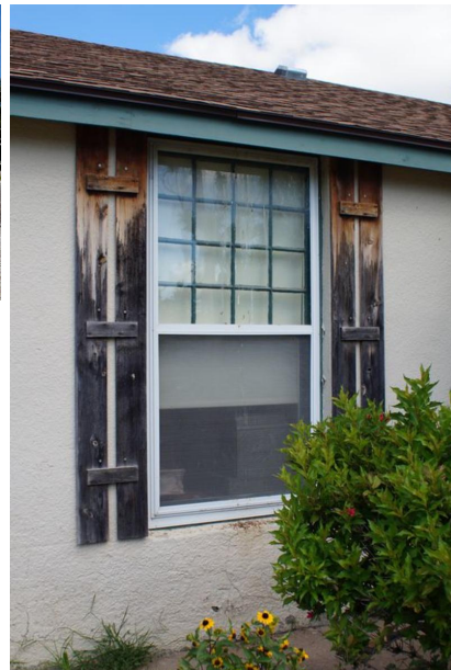
Fort Dodge – Army Quartermaster Building. 217 Pershing Street. East elevation window; looking northwest. 08/16/2017.