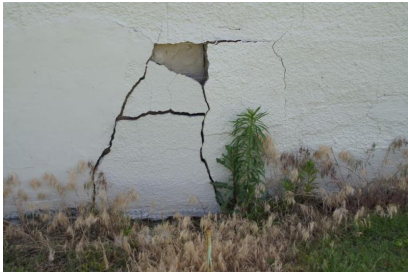
Fort Dodge – Army Quartermaster Building. 217 Pershing Street. West elevation; looking east. 05/25/2017.