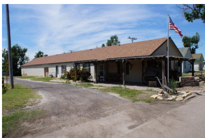
Fort Dodge - Army Quartermaster Building. 217 Pershing Street. East (front) and north elevation; looking southwest. 05/25/2017.