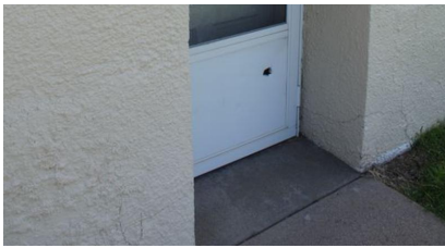
Fort Dodge – Army Quartermaster Building. 217 Pershing Street. West elevation entrance; looking southeast. 05/25/2017.