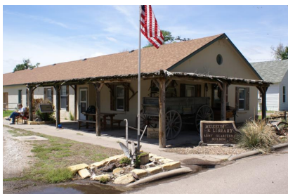
Fort Dodge - Army Quartermaster Building. 217 Pershing Street. East (front) and north elevations; looking southwest. 05/14/2015.