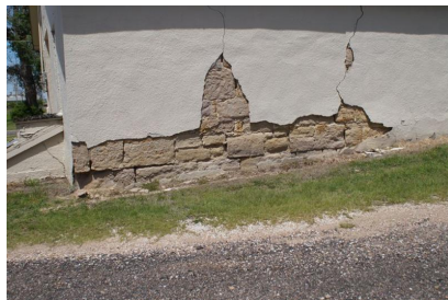
Fort Dodge – Army Quartermaster Building. 217 Pershing Street. East elevation at southeast corner of building; looking west. 05/25/2017.