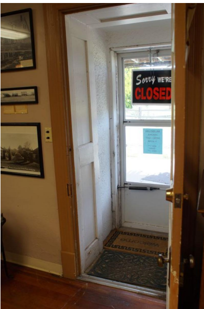
Fort Dodge – Army Quartermaster Building. 217 Pershing Street. Interior, primary entrance; looking east-northeast. 05/25/2017.