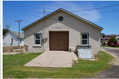
Fort Dodge – Army Quartermaster Building. 217 Pershing Street. South elevation; looking north. 05/25/2017.