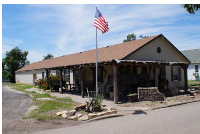
Fort Dodge - Army Quartermaster Building. 217 Pershing Street. East (front) and north elevation; looking southwest. 05/25/2017.